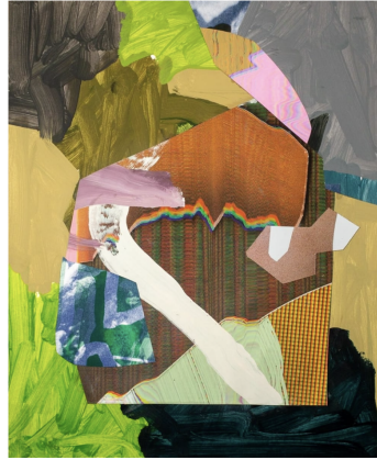
HAR LUMOD, 2020