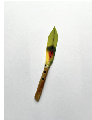
FEATHER KNIFE IV, 2022

Ethically-sourced Lady Amherst's pheasant ( Chrysolophus amherstiae ) feather, paperclay, vintage knife handle