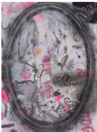
MIRROR STUDY 2, 2022