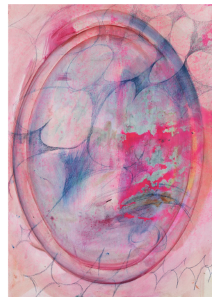
MIRROR STUDY 3, 2022