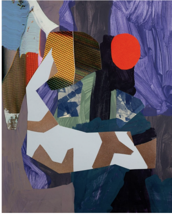
BONX CHAN, 2020