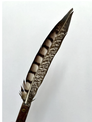
FEATHER KNIFE II, 2022

Ethically-sourced Great Argus ( Argusianus argus ) feather, paperclay, vintage knife handle