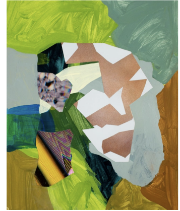
MULD FEGG, 2020