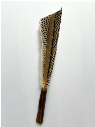
FEATHER KNIFE I, 2022

So when a gallery builds a not insubstantial part of their program around keeping well-stocked flatfiles, it's worth taking note; and when they mount an exhibition that frees the work from the drawers and lets it live (at least for a little while) on the walls, as the Chicago gallery Goldfinch has done with their recently mounted and simply titled exhibition A Flatfiles Show , it's certainly worth having a look.