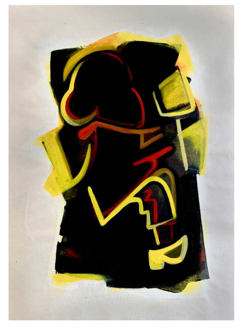
Carris Adams, Chicken King # 14, 2018. Oil and acrylic on canvas, 24" x 30"

The roughly five mile stretch of Lake Street that traverses Garfield Park, Austin and Oak Park proves ideal for this. The types of business you see there are the ones that deal with necessities in one form or another: corner grocery stores, take-out restaurants, auto mechanics, churches, pawn shops, liquor stores. Over time, I developed not just a familiarity with but a fondness for a number of the older, hand-painted or otherwise idiosyncratic shop signs I'd see along my drive. When traffic was really slow, I could take snapshots. Scrolling through these images on my phone now, I'm struck by the repeated use of attention-grabbing color combinations of yellow, black, red and blue. A sign painted on the side of MJ Food Mart on the corner of Lake and Pulaski, for example, employs red, black and blue lettering against a brick wall painted in two shades of yellow—a pale butter background, with brighter, Post-It note yellow squares of paint used to emphasize the fact that they are open "7 days" and offer bread, eggs, milk, pop, and other staples. Across the street, the L&J Liquor sign also uses yellow, black and red, as does the one for West Loop Furniture Depot a few blocks down. A favorite of mine is BABA'S on Lake and Laramie, a restaurant whose name is announced via alternating yellow and blue capital letters, below which appear the words "FAMOUS STEAK & LEMONADE" in blue against a white ground. In red, the word "HALAL" is perched at an angle