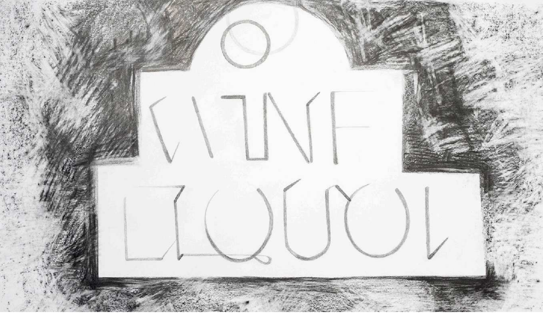
Carris Adams, Untitled, 2018. Graphite on paper, 30" x 40"